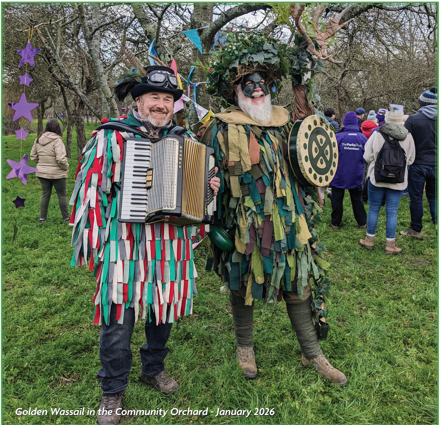
Golden Wassail in the Community Orchard - January 2026