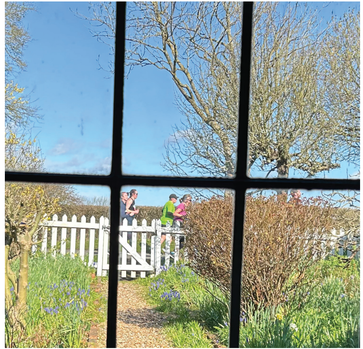
Congratulations to all those who took part in the Festival of Running 2026