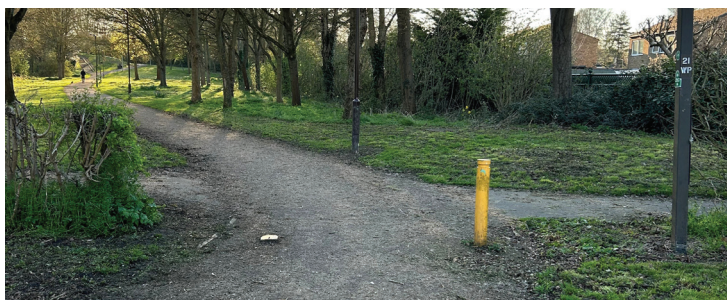
We are aware and are seeking a replacement of the missing yellow bollard and lock, which act as an illegal encampment deterrent, to the entrance of Woughton Park Village Green