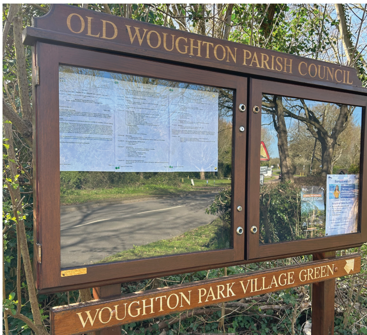
We have been carrying out repairs and maintenance to our notice boards across the parish