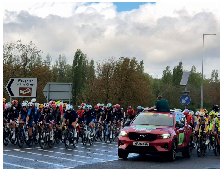
The Peleton of the Tour of Britain 2025 race as it passes Woughton on the Green, shortly after setting off on the Milton Keynes to Ampthill stage.