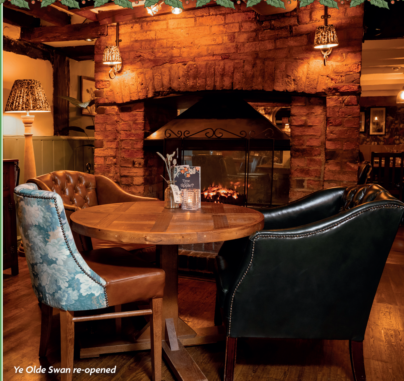
Ye Olde Swan re-opened