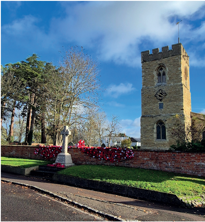
Tributes were paid on Remembrance Sunday, the 80th anniversary of the end of the Second World War.