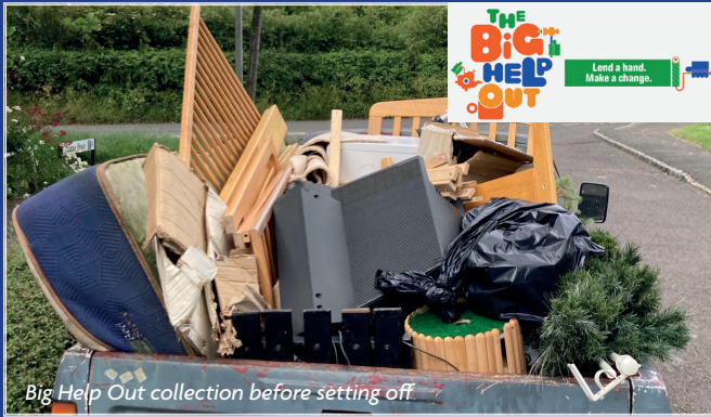
Big Help Out collection before setting off

Please let us know if you want to make use of the spaces we have for meetings, weddings and dinners.