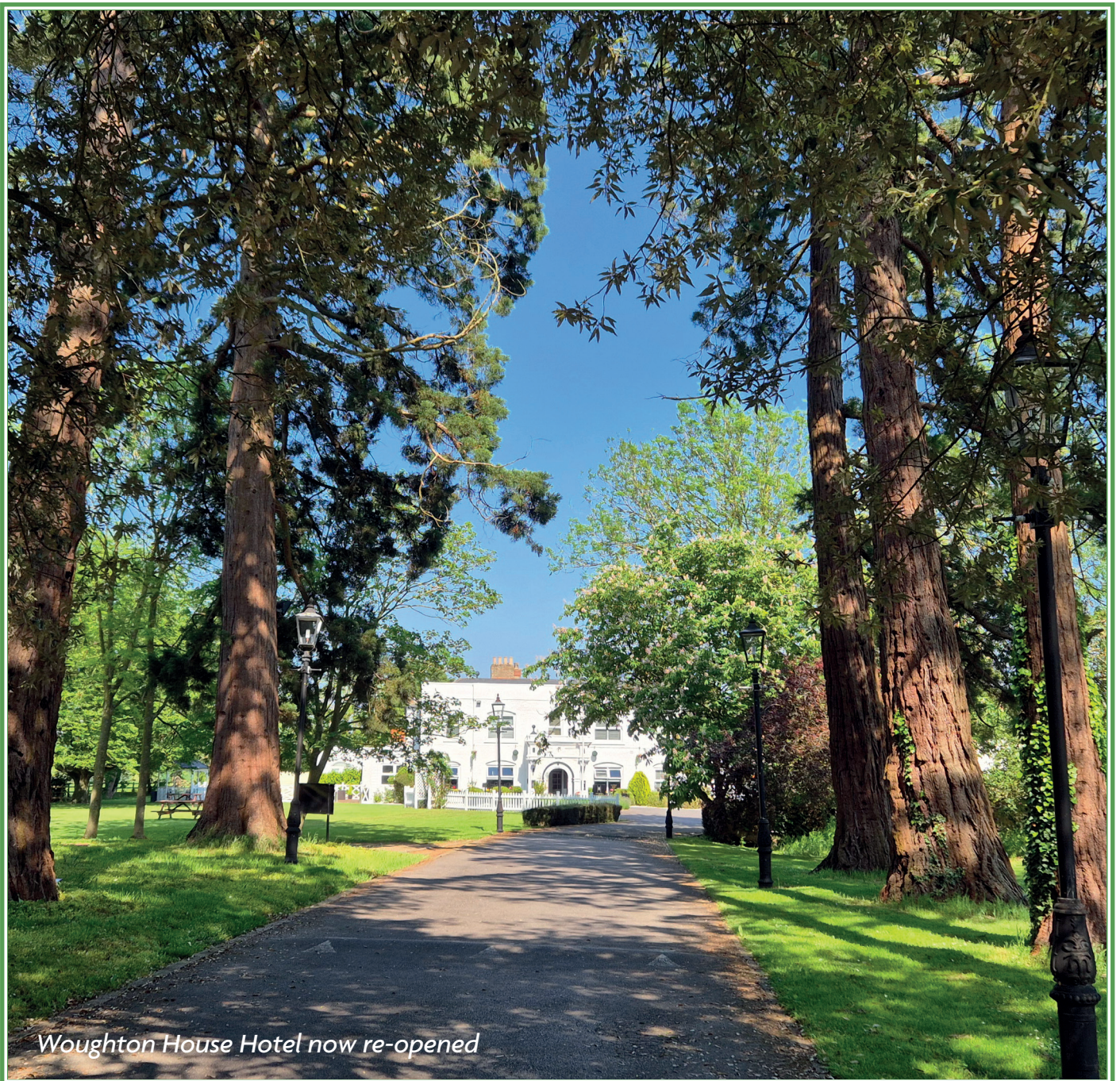
Woughton House Hotel now re-opened