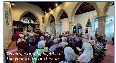
Coverage and highlights of the year in the next issue