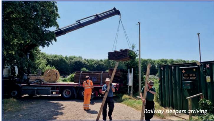
Railway sleepers arriving

More recently improvements have been made to the site from the rental income. The size of the site means boundary security has always been a problem, and following a failed attempt to reinforce the boundary using several hundred pyracantha plants it was decided to invest in palisade fencing to reinforce the more vulnerable parts of the boundary. It was also found necessary to increase the height of the easily climbable gates! As funds permit, the fencing continues to be expanded to cover the whole site boundary. Only 40 metres remain to be erected but completion has been delayed owing to the fencing contractor being otherwise engaged on the HS2 project.