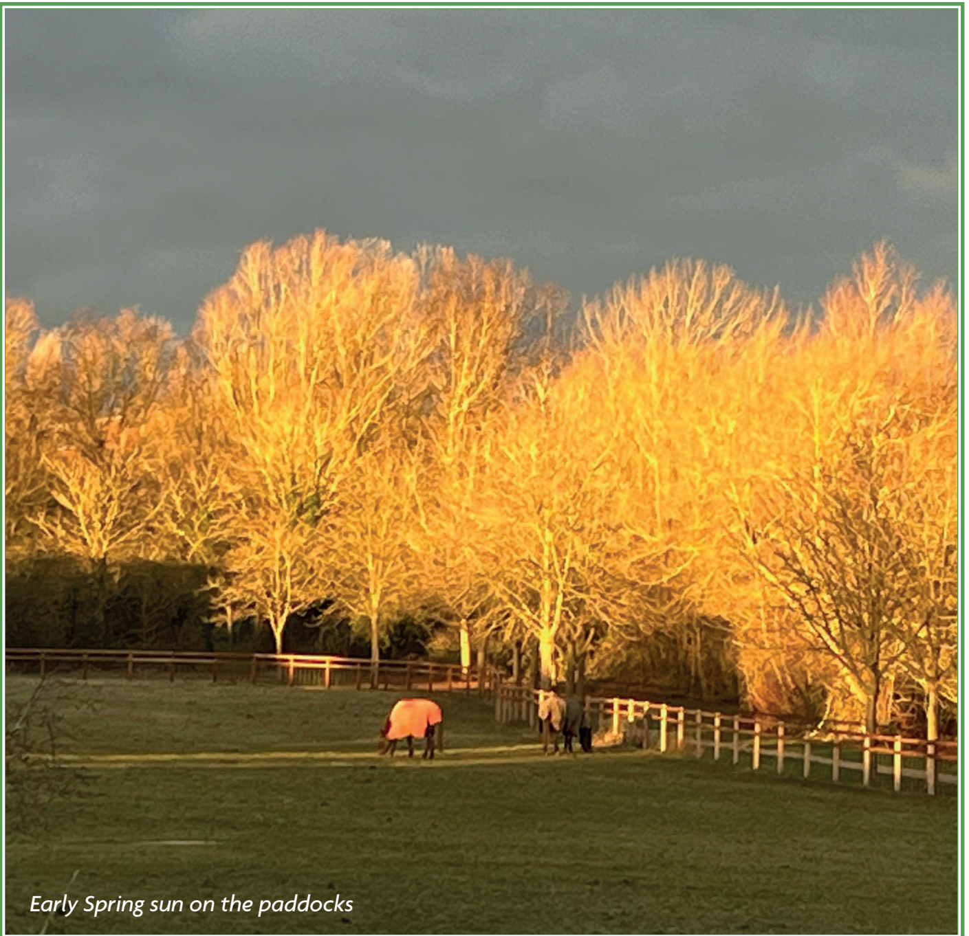
Early Spring sun on the paddocks