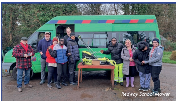
Redway School Mower