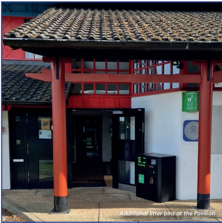
Additional litter bins at the Pavilion