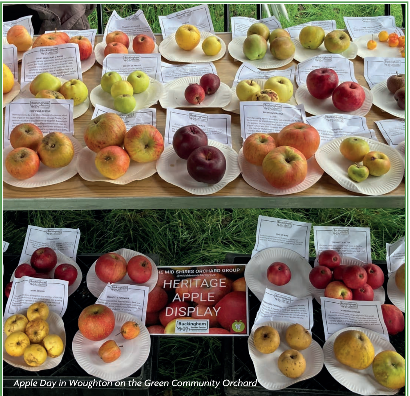
Apple Day in Woughton on the Green Community Orchard