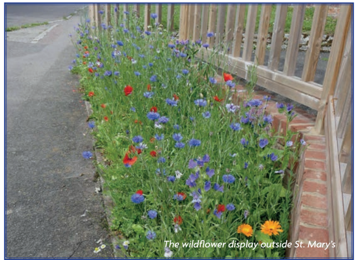
The wildflower display outside St. Mary's