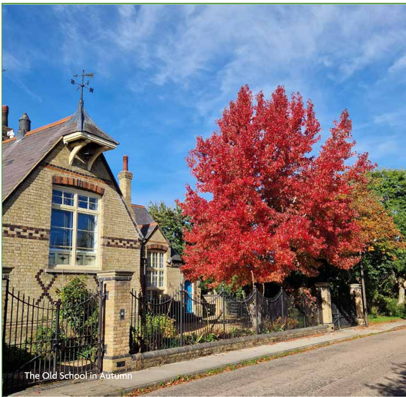
The Old School in Autumn