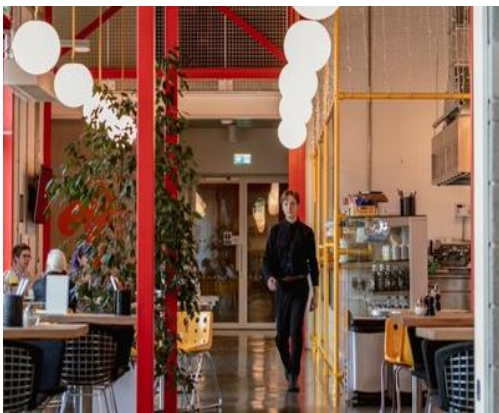
Images: MK Gallery (top left); the Shop (top right); a guided tour an exhibition (bottom left); and the Cafe.

MK Gallery is hosting an open evening on Tuesday 25 October, between 5-7pm, and invites people from local communities to come and see what volunteering opportunities are available at the Gallery.