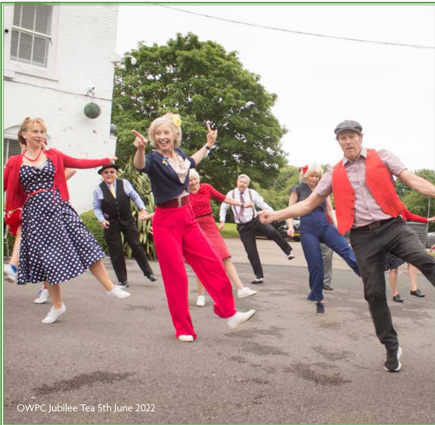
OWPC Jubilee Tea 5th June 2022