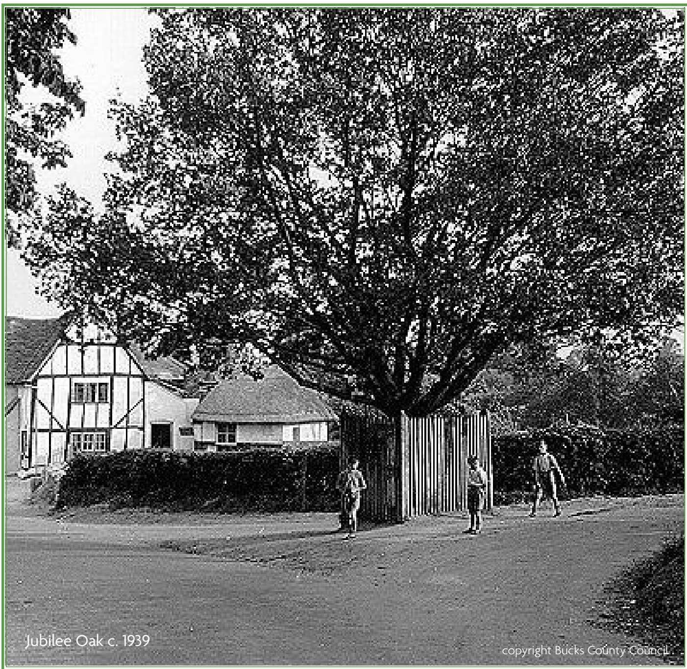
Jubilee Oak c. 1939