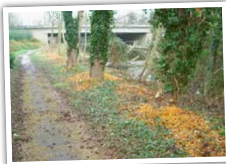
Land along the canal was very overgrown with many self-set saplings

During 2020, a project to clean the mud, grass and moss from the footpaths within the estate was progressed and MK Highways agreed to undertake the task within their own budget. So, building on the 2019 consultation, we then looked at the canal path behind house nos 62 to 74, which had been severely neglected. After consultation with MK Landscapes it transpired that the land immediately behind the houses was within the existing Serco contract and this became the project for 2020 /2021. The growing relationship between OWPC and MK Landscapes also led to the removal of two dangerous trees, whilst the hedge height was reduced to give much needed visibility around a blind bend into the cul-de-sac between house nos 54 and 74.