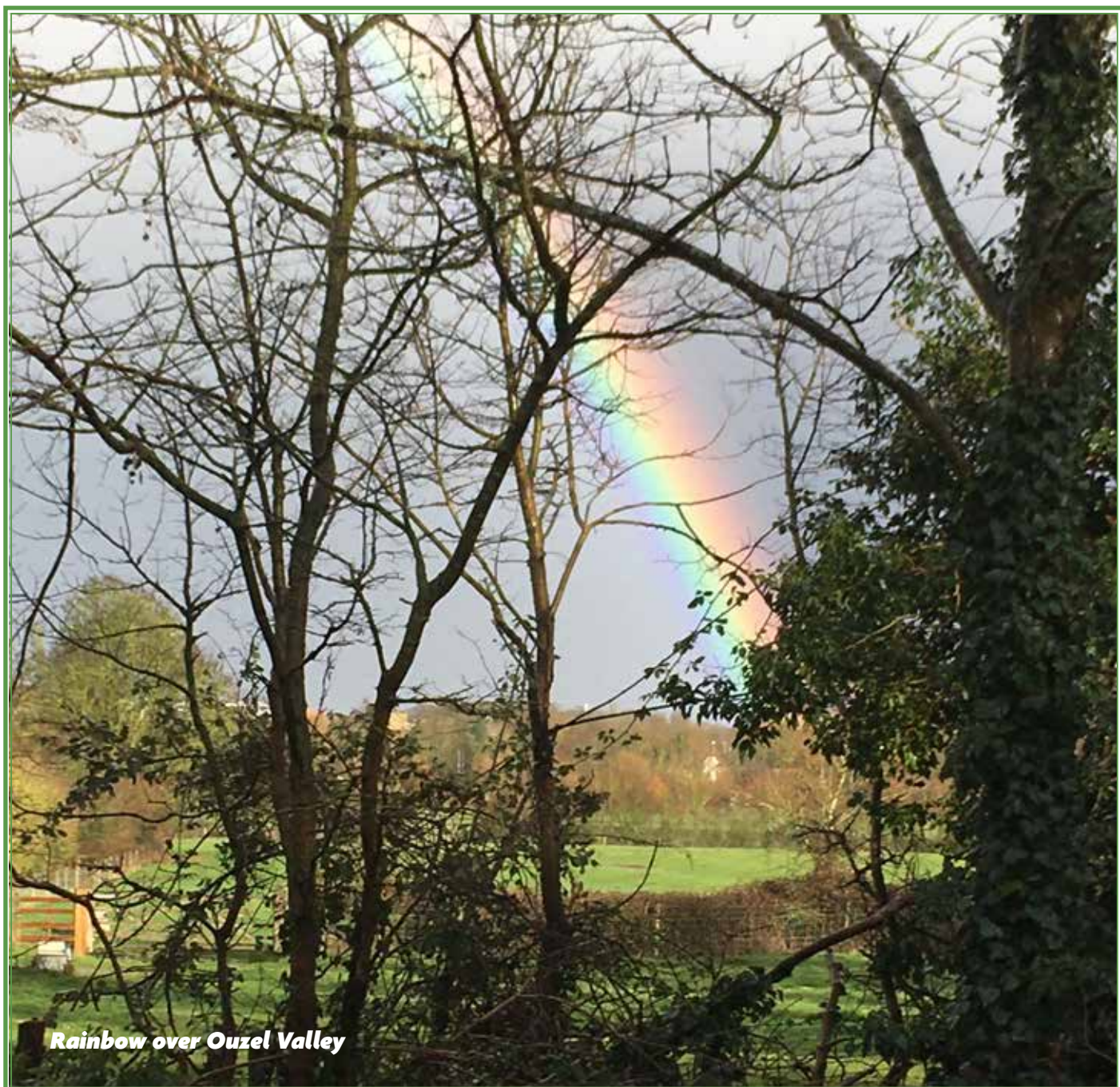
Rainbow over Ouzel Valley

The Newsletter of Old Woughton Parish Council