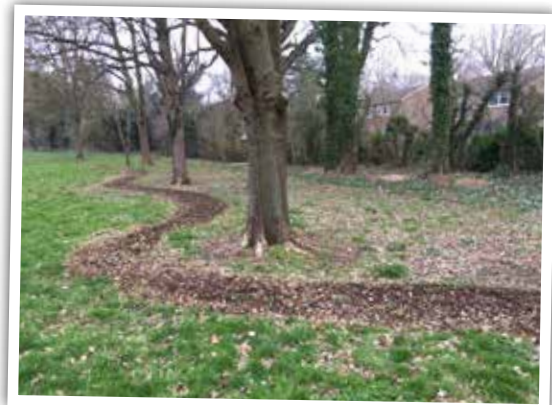
‘New wild flower bed on the village green’