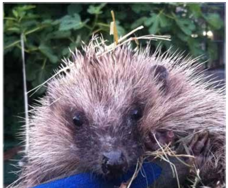
'Twiglet' was found in the road - The Green - last Summer

Tiggywinkles is a unique wild animal teaching hospital- why not go and pay a visit.....you will be amazed at their work. www.tiggywinkles.com