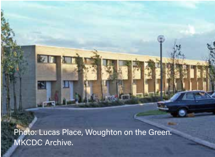
Photo: Lucas Place, Woughton on the Green.

Did you know that in 1975-77, when Lucas Place was first built, each house facing the road had its own tree? This means there were originally 34 rowans, yet only ten survive today, with most of those (6no.) located at just one end of the street.