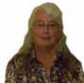
Mary Major Dog Bins, Noticeboards, Projects