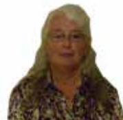
Mary Major Dog Bins, Noticeboards & Projects